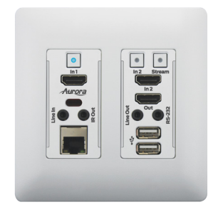
Wall Transceiver VLX-TCW2H-C