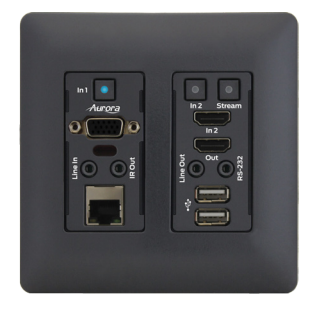
Wall Transceiver VLX-TCW2V-C